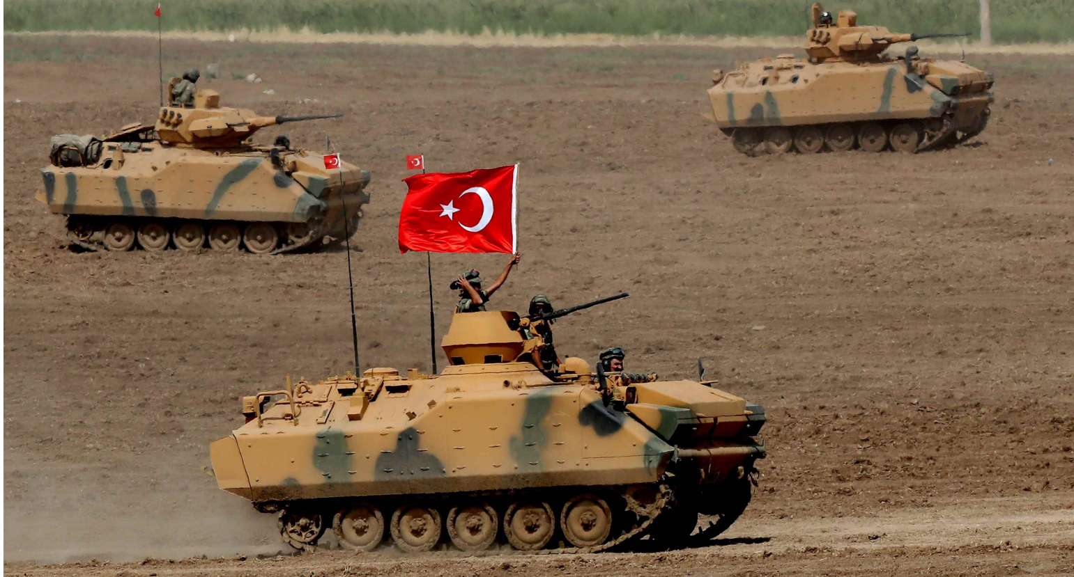
Operation Olive Branch

the Soviet Union. Should deterrence have failed, Turkey would have made its facilities available to NATO and would have distracted as many Soviet forces as possible from a campaign in Central Europe.