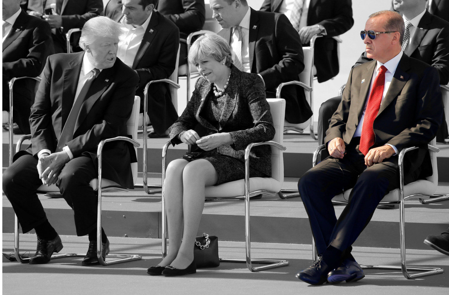
NATO Leaders Summit, Brussels 2018

terrorism for decades since the late 1970s and, in Part II, how Turkish governments have found their own solutions, in one way or another, by seizing the opportunities that emerged out of the conjunctural changes taking place in the world, without tangible support coming from their allies.