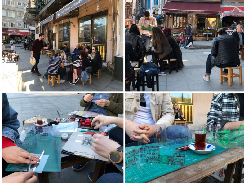
Figure 2. The coffee house as a studio, Ozan Avci, 2018.

quickly. This performative 4 act attracts the attention of the public, redefines the public space and makes people to rethink about the limits of public space and the dynamics of everyday life practices (Fig. 3). Flash mobs demonstrate the power of bodily performance on the transformation of public space into another spatial mood, such as a studio, an atmosphere.