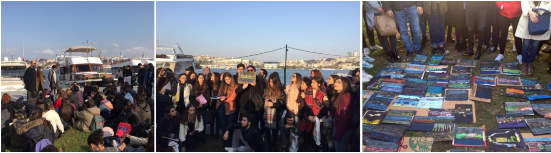
Figure 4. Cibali as a studio, Ozan Avci, 2018.