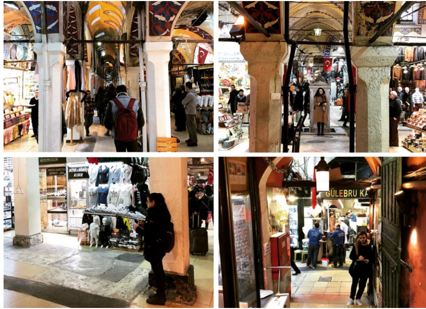
Figure 10. The Grand Bazaar as a studio, Ozan Avcı, 2018.

In this way, an architectural course turns into a retroactive research based on bodily experience. Experience is a flow of time-space relations that are intertwined with perception and sensation. Each event of perception opens up to its own world and the world of perception is merged with the real world itself. When you use the city as a studio, the dynamic character of architectural knowledge unfolds itself and extends its content. In this critical pedagogy, architectural education becomes interactive between the city users and the students and transforms both of them.