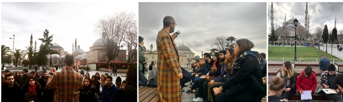
Figure 9. Sultanahmet square as a studio, Ozan Avci, 2018.

During these discussions it is possible to have contributions from the locals. By this way, the talk and discussion become a free lecture for everybody. The city acts like an open platform to share knowledge and to gather around (Fig. 9). During that studio hours, there is no “other” and everybody that is sharing those moments become one. This performative act helps us to break the social and cultural borders and gives us a chance to know each other (Fig. 10).