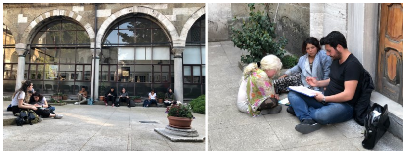
Figure 6. Koprulu Mehmet Pasa Mederesesi as a studio, Ozan Avci, 2018.

During this process, we encounter different locals and experience various topographical, social and cultural practices. Every encounter not only affects my students but also the people there. Our presence acts like a flash mob and takes the attraction of the people. They observe how we use the space, change the borders between public and private spaces and what we produce. This encounter creates a great interest and starts a dialogue between the locals and us (Fig. 6). Each dialogue is an expression of the self, for both sides, and unfolds the social and cultural layers spontaneously.