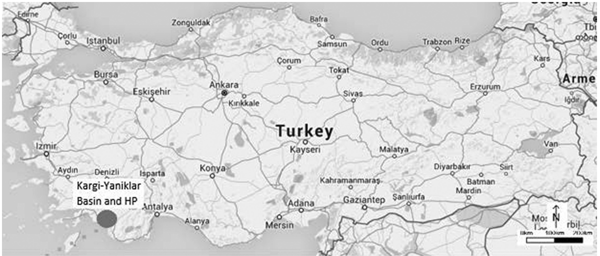
Fig. 2. Kargi-Yaniklar Basin and HPs.

elevation and an abundance of brooks and streams (TMMOB, 2011). The coastal strip is dotted with resort towns, which have high electricity demand in summer, while the region's hinterland is comprised of small, agrarian communities. The dual benefits from irrigation and electricity generation have made the region one of the focal points of Turkey's small-scale hydropower policy with hundreds of HPs in planning or under construction. Whereas the HPs in the Black Sea region have received attention in scholarly studies (Eryilmaz, 2012; Islar, 2012a; Erensu, 2013), there is not a comparable body of literature that systematically surveys the HPs in the Western Mediterranean. This deficit is especially relevant considering that the Mediterranean Basin is designated as a 'biodiversity hotspot' by the International Union for Conservation of Nature. Such zones are often habitats of endemic or endangered species, subject to national legal conservation schemes (e.g. national parks, special environmental protection areas, etc.), and are under the purview of the 1976 Barcelona Convention.