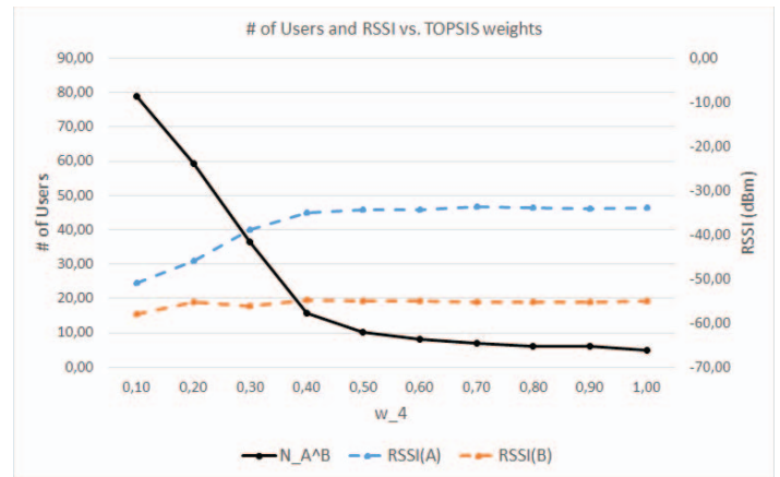
Fig. 3: Number of users at AP-A vs. weight values, w_4

The present work was carried out within the framework of Celtic-Plus SHARING project and supported in part